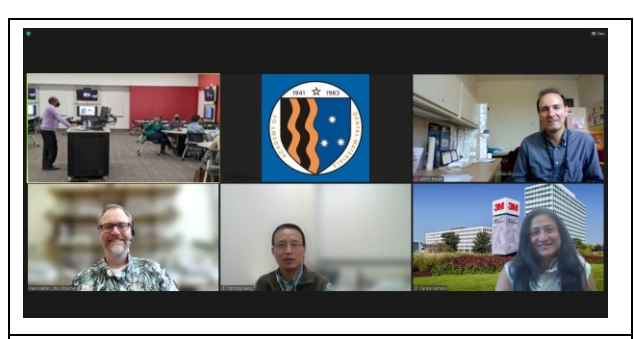
A gathering in Minnesota, attended by local ADM members, that coincided with the ADM virtual meeting in Oct 2021.

Science Education Center (HSEC), which was equipped with state-of-the-art video/audio facilities. Five members presented their research outside the official ADM program. Several members from 3M also attended the local presentations and question-and-answer session remotely via Zoom.