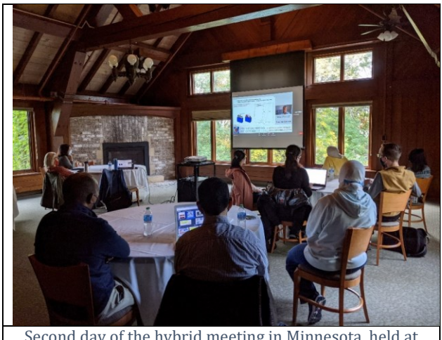
Second day of the hybrid meeting in Minnesota, held at the Minnesota Landscape Arboretum

The second day of the hybrid meeting was held at the picturesque Minnesota Landscape Arboretum in Chaska, MN, where participants were able to explore its beautiful gardens of different themes after the ADM business meeting. There were no in-person activities on the third day and participants were encouraged to watch the remaining ADM presentations and participate in the question-and-answer sessions on their own.